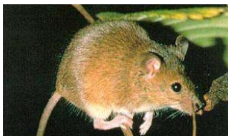
Figure 6. House mouse. Average litter size is six and one female can have up to eight litters per year. Average range is 15 to 30 feet. A mouse can last longer without water than a camel.

Maintain a rodent control program around the poultry house. When building the floor, integrating heavy gauge wire mesh beneath the subflooring is recommended to discourage entrance of predators and other varmints. Cover windows and vent openings with good quality poultry wire to keep out birds. Make sure doors and windows fit tightly. Caulk and seal all cracks and crevices. Small rodents can gain entry through holes the size of a nickel or quarter. Keep the poultry house locked to discourage theft and uninvited visitors.