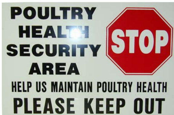
Figure 7. Always think about what you can do to protect your own birds and your neighbor's birds from disease.