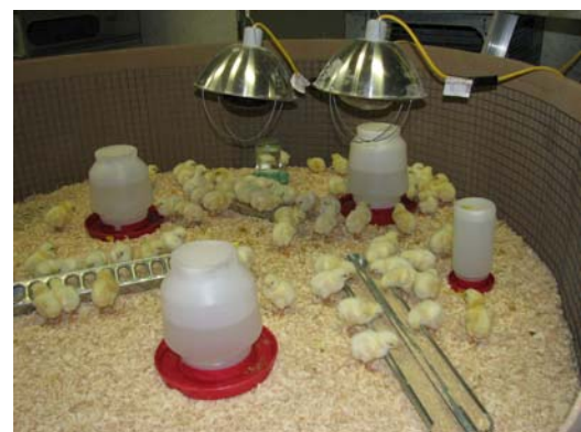
Figure 2. Example of a brooder ring.