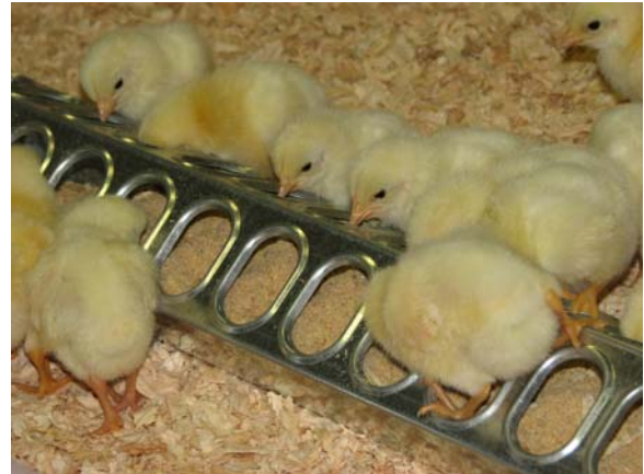
Figure 5. Example of one type of feeder commonly used to start chicks.