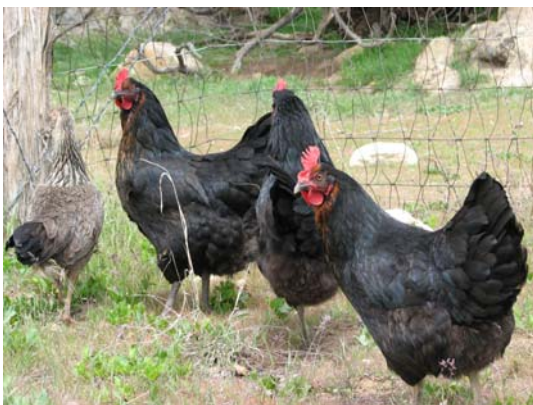
Figure 1. Hens enjoy the spring breeze.

Backyard chicken keeping is increasing in popularity. There are many reasons for this. Perhaps it is to have a ready source of eggs and meat, or as a backyard help in pest control, or perhaps it is just because they are fun to watch. Whatever the reason, chickens can be a great source of enjoyment if properly managed and given appropriate care.