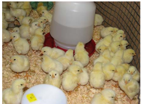
Figure 4. Chicks shown drinking from a 1 gallon fountain-type waterer.

Although types and designs of drinkers vary, the fact that fresh clean water must be present at all times should never be forgotten. Fountain-type drinkers have the advantage of being affordable and easily moved around; however, because the reservoir holds only a finite quantity of water, it is necessary to watch carefully that they don't become empty.